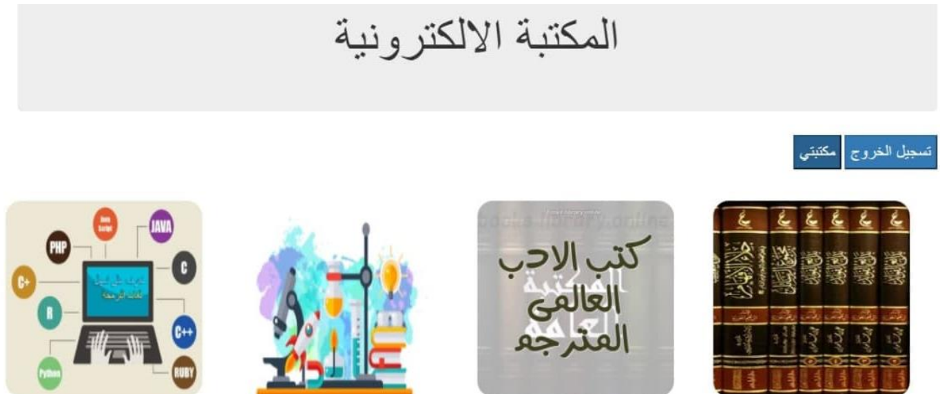
Figure 3.5 shows a page after logging in

3.6 A new book can be added by clicking on the My Library button